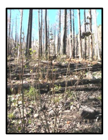
Browsed aspen suckers soon after wildfire in northern Arizona

Regardless of disturbance aspen or type, maintaining aspen resilience is highly dependent on local levels of ungulate herbivory (Seager et al. 2013). In the West, prominent aspen browsers include cattle, sheep, elk, and deer. If great care is not taken to protect postdisturbance and posttreatment stands from