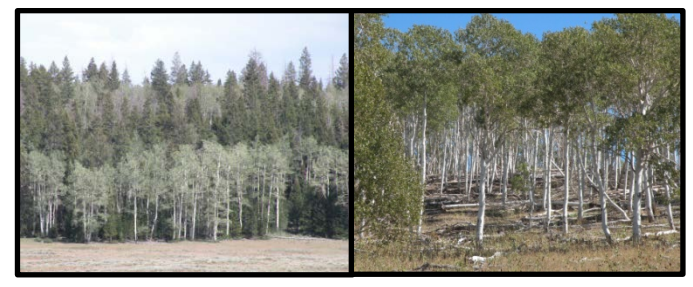
Montane seral (L) and Colorado Plateau stable (R) aspen

use. The elevated level of forest and rangeland burning during this period resulted in many of the mature aspen forests we see today (Kaye 2011).