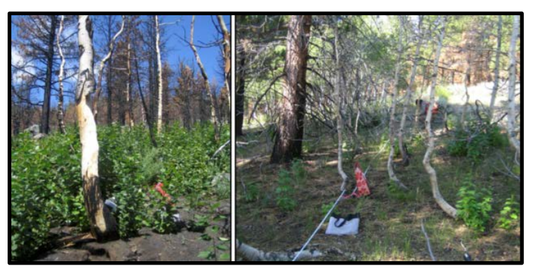
Fig. 4. Two years post-fire: high severity (left) and low severity (right). Note differences in the density and growth rate of aspen regeneration

Aspen restoration and management strategies are more likely to be successful if they incorporate the functional role of