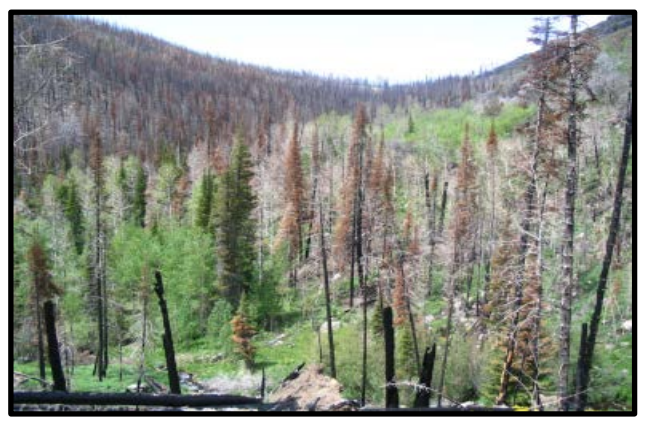
Fig. 1. Unburned aspen surrounded by severely burned conifers in the Jarbidge Mountains, Nevada

The relatively high fuel-moisture content in many aspen stands often makes them resistant to fire spread (Fig. 1). However, fire will carry through aspen stands when fireweather and fuel conditions are ideal (e.g., when fire-prone conifers are present). Aspen are easily top-killed by crown fires. However, because aspen has thin bark, even low intensity fires can result in mixed- or high-severity effects, and surviving aspen trees are often stressed and highly susceptible to secondary mortality agents (Baker 2009).