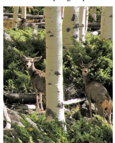
Fig. 1 Mule deer outside fence at Pando

In the 1970s, researchers Kemperman and Barnes (1976) examined relationships between leaf physiology, clone size, and regional biogeography of quaking aspen. These scientists discovered a very large aspen clone near Fish Lake in south-