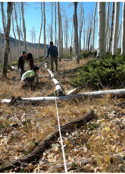
Fig. 4 Students monitoring at Pando.

monitoring (Fig. 4), adjustment—is likely to yield desirable and demonstrable endpoints for restoration at Pando and aspen at-large.