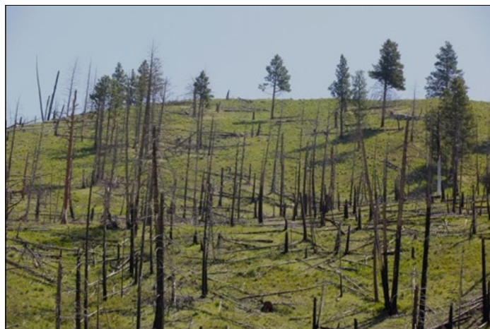
Figure 2. Burned area in the Sapphire Mountains, Bitterroot National Forest near Darby, MT.

By summer 2000, live fuel moistures on the BNF were as much as 75% below normal. Dry lightning strikes on July 31, 2000 started approximately 100 fires. High air temperatures, extremely dry fuels, and occasional high winds resulted in large and small fires converging into large fire complexes. By the end of the summer, 356,000 acres of forest in the Bitterroot Valley burned (Figure 2), and suppression efforts cost more than 85 million dollars.