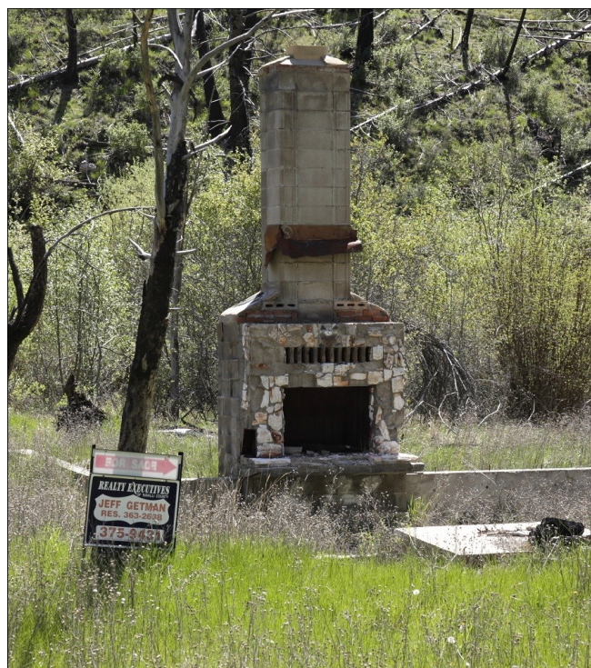
Figure 3. Burned home and property along North Rye Creek.