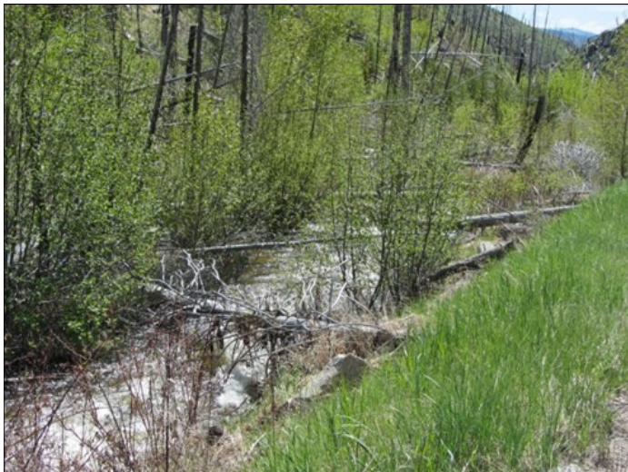
Figure 4. Woody debris in North Rye Creek.

Although debris flows can be detrimental to watersheds in the short-term and they were responsible for some roadway washouts in the BNF, they are the major natural drivers of topography and contribute to the delivery of large rocks and woody debris to streams, which provide fish habitat.