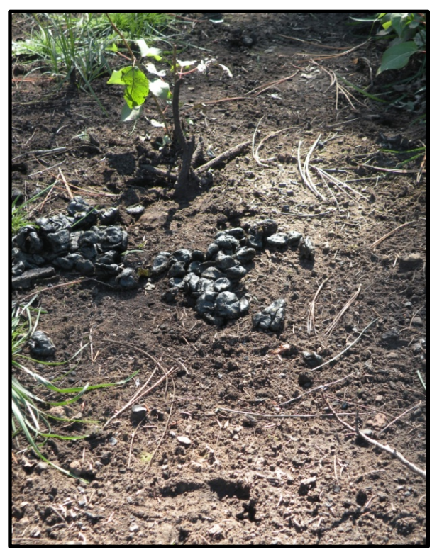
Elk scat and browsed aspen sucker following a wildfire in Arizona.

3) Aspen abundance: The density and extent of aspen also matters, with large, dense stands generally regenerating better. Whereas the fires in Yellowstone in 1988 were large and severe, there was still significant aspen and willow decline due to herbivory because there was limited browse material in this landscape to begin with. We have observed similar problems in southern Utah where patchy aspen stands regenerating after fire are browsed heavily even when ungulate populations are moderate.