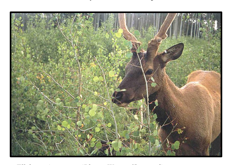
Elk browsing aspen

Aspen plays a fundamental role in facilitating post-disturbance re-establishment of forest communities, but intense browsing by ungulates can be detrimental to aspen establishment and recruitment (Seager et al. 2013). A regional survey of aspen understories across central and southern Utah showed that approximately 40% of aspen stems display evidence of browsing. Incidence and severity of browsing vary, suggesting that there are multiple factors that influence aspen browse susceptibility. However, aspen forests only require 500 to 1,000 suckers per acre to escape herbivory and recruit into the overstory for the stand to persist.