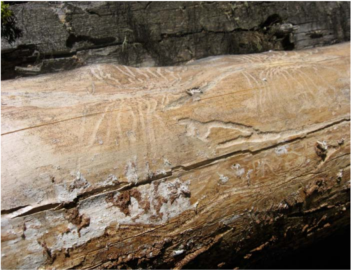
Beetle galleries in an old log, showing that trees killed years ago still display evidence of beetle attack.

200 campgrounds, and after 3 or 4 years of hard work, “we’re just about done.”