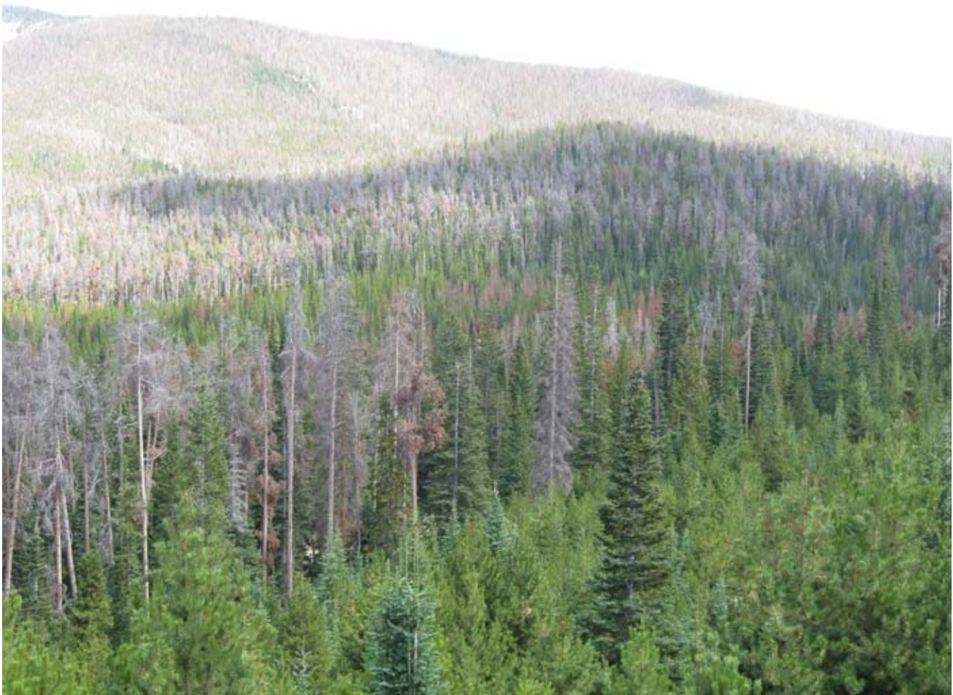
A beetle-killed spruce-fir forest at the gray stage in Colorado's Willow Creek Pass.

researchers found short-term increases in surface fuels, even though they, like Simard's team, reported reduced canopy fuels after a beetle attack.