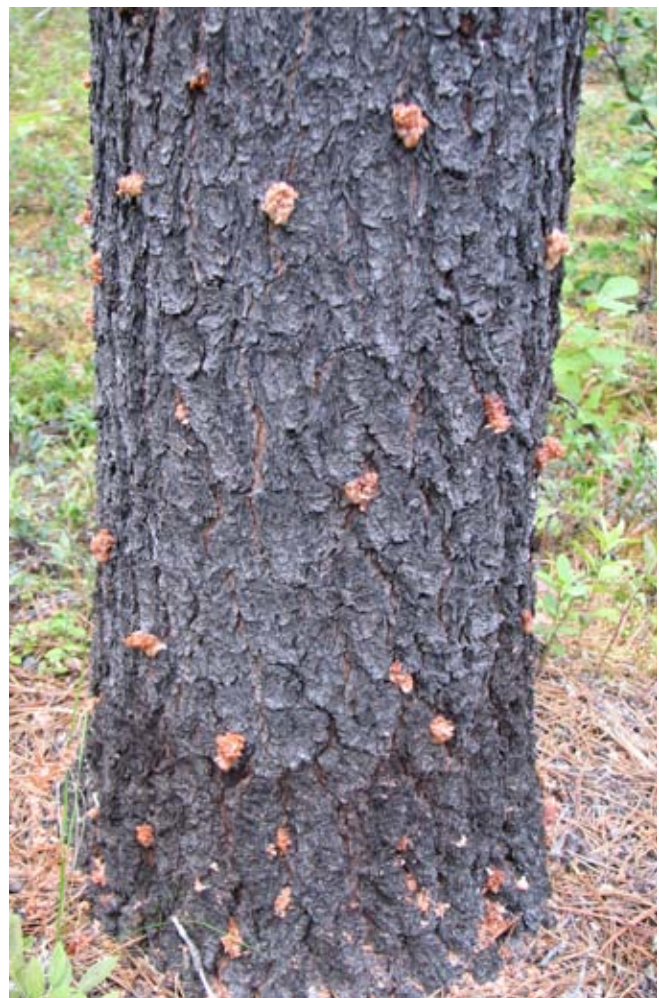
Sap oozes from entry wounds made by mountain pine beetles.

In another retrospective study, Veblen and Kulakowski were surprised to find that fire spread no more extensively in a mountain-pine-beetle-killed forest in the red stage than in a comparable green forest. They did see greater fire severity (i.e., more complete vegetation mortality) in areas with many trees on the ground, but it didn't matter how the trees got there—whether they toppled in a windstorm (which these trees had, in 1997) or were felled by beetles. "Our work," Veblen says, "has shown that catastrophic fire is not an inevitable consequence of beetle kill."