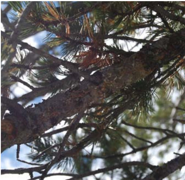
Beetle damage on a pine branch.

back to preoutbreak levels. After 35 years, “canopy bulk density was still low, and thus only passive fires were predicted [by the model]” under intermediate conditions, according to the final project report (Tinker 2009).