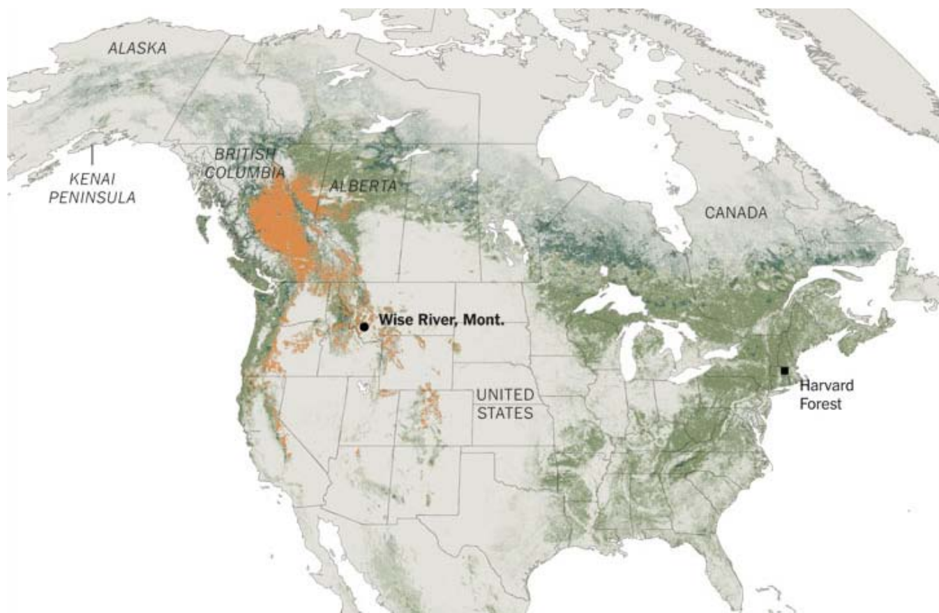
Areas in orange were affected by the mountain pine beetle in Canada, 1999–2010, and the U.S., 2005–20 (projected). Source: http://www.nytimes.com/interactive/2011/10/01/science/earth/forests.html?ref=earth .

Right now, these beetles are in full-blown epidemic mode. "It's continental in scale, from