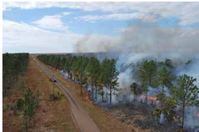
Personnel from Eglin Air Force Base's Jackson Guard ride all-terrain vehicles to ignite a 200-hectare forested burn block.

The initial study plan called for two large operational-scale burns (up to 500 hectares) on land covered with grass and grass/turkey oak vegetation. Nested within these large plots were several smaller highly instrumented plots (HIPs) of 20 by 20 meters. The large burns, including the HIPs, were loaded with instruments to measure larger scale fire behavior and fire-atmospheric interactions, including smoke dynamics. Alongside the operational burn plots were