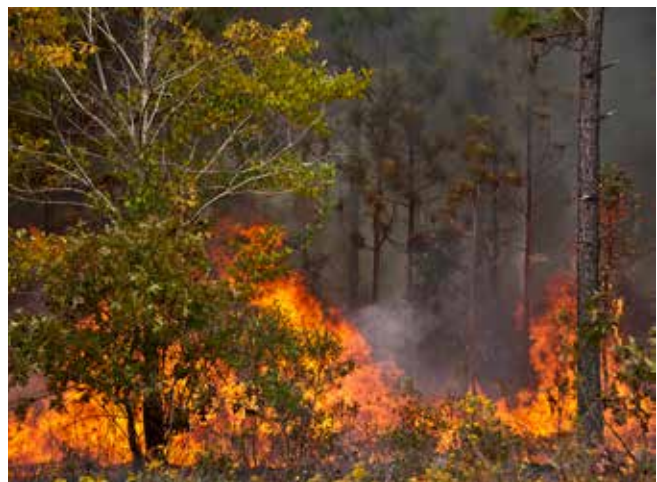
An RxCADRE prescribed fire consumes trees and shrubs at Eglin Air Force Base, Florida.