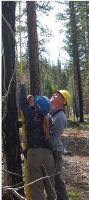
Study sites were evaluated and individual nests were identified and examined.

Black-backed woodpecker nest numbers in the area of the Silver/Toolbox Fire in Oregon were evaluated both before and after salvage logging operations, and these were compared with control areas in the same fire area that were not logged. Salvage logging slightly decreased snag density and average snag diameter, whereas coarse woody debris increased after logging.