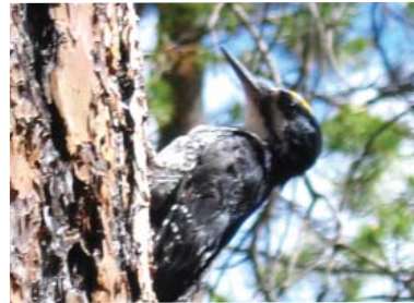
Lewis's woodpecker exits a nest cavity in a ponderosa pine snag 16 years after the 1992 Foothills Fire in Idaho.

White-headed woodpecker displayed similar patterns in nest site selection as Lewis's woodpecker. The landscape surrounding white-headed woodpecker nests was open-canopied before and, consequently, after wildfire. The habitat at nest trees of white-headed woodpecker had fewer live trees per hectare and more decayed and larger diameter snags than at non-nest sites. They also used a mosaic of burn severities after wildfire.