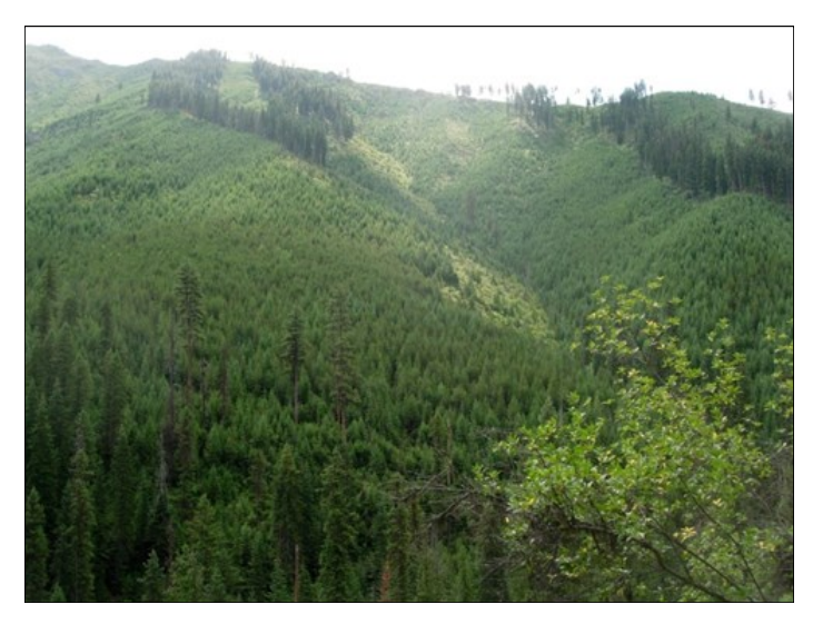
Figure 4. Mosaic of different aged burns in the White Cap region of the SBW.

Despite the Forest Service's successful history with allowing many fires to burn in the SBW and FCRNRW, and despite research suggesting that restoring a natural fire cycle may promote smaller, less severe fires in the future, the future of wilderness fire is uncertain (Figure 4).