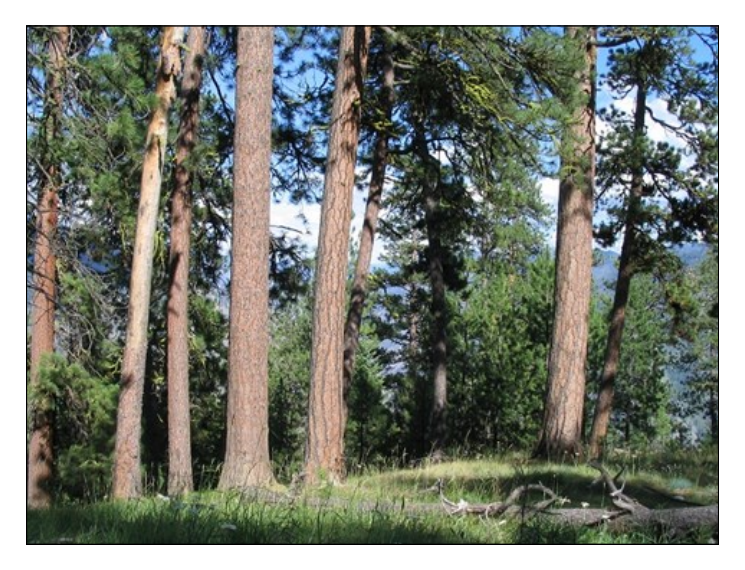
Figure 1. Ponderosa pine-dominated stand in the SBW.

Regardless, insightful presentations and lively discussions during the trip included a diverse group of perspectives from researchers, managers, residents, and other stakeholders.