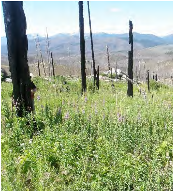
Figure 4. The 2007 Cascade Fire burned on the Boise National Forest. This particular area burned at high severity twice, leaving little standing or downed woody fuel. There has been little tree regeneration, and shrubs dominate the site.

There are multiple cases in the last few years where local units have used previous wildfires as fuel breaks or natural fire perimeters, decreasing personnel in those areas, or monitoring only (Bobby Shindelar, Fire Management Officer, Boise National Forest, pers. comm.).