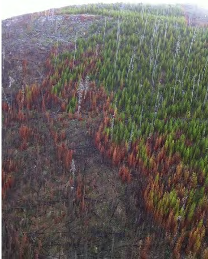
Figure 2. The 2012 Octopus Mountain Fire burned through the 1991 Spar Mountain Fire in Kootenay National Park in the Canadian Rockies. The fire burned through dense regeneration of lodgepole pine with heavy fuel loads of downed logs. At some point in post-fire stand development, these forests will once again produce enough fuel to carry fire. Land managers want to know when that threshold is reached (Robert Gray, Fire Ecologist British Columbia pers. comm.).

The influence of past fires on future wildfires can be considered the landscape memory of previous disturbances. Landscape memory is defined as the degree to which previous ecological processes influence future processes (Peterson 2002). For example, in a subalpine forest, large single-aged patches on the landscape may be the result of past high-severity fires. Conversely, in old-growth ponderosa pine forests, the open park-like structure seen in early photographs (e.g. Flack 1956) may be the result of repeated, low-severity, surface fires that promoted grass growth and suppressed prolific tree regeneration (Covington et al. 1997). Landscape memory is largely dependent on the severity and extent of previous wildfire(s) as well as the rates of vegetation recovery relative to the time between subsequent fires. Wildfires occurring in relatively quick succession and before vegetation has fully recovered