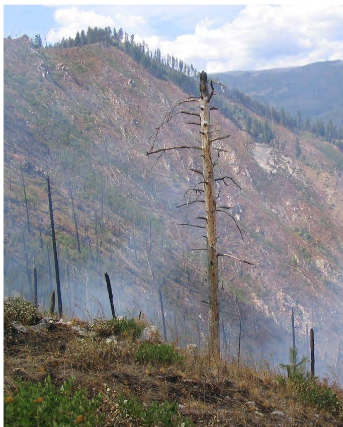
Figure 1. In Douglas-fir dominated forests along the Salmon River in the Frank Church River of No Return Wilderness, the 2005 Bear Creek Wildland Fire Use Fire reburned portions of the 1986 Devil's Teeth Fire. Shrubs and grasses were the primary drivers of this fire because tree regeneration was sparse in these dry, low-elevation forest types.

For this paper, we reviewed and summarized information and identified knowledge gaps in the recent literature on the impact of previous wildfires on subsequent wildfires. We reviewed empirical studies from refereed journals and technical reports published within the last 10 years. We included studies from compiled field or remotely sensed data that focused on the interaction of two or more wildfire events and their severity and spread. Studies were